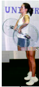
2 nd Pull